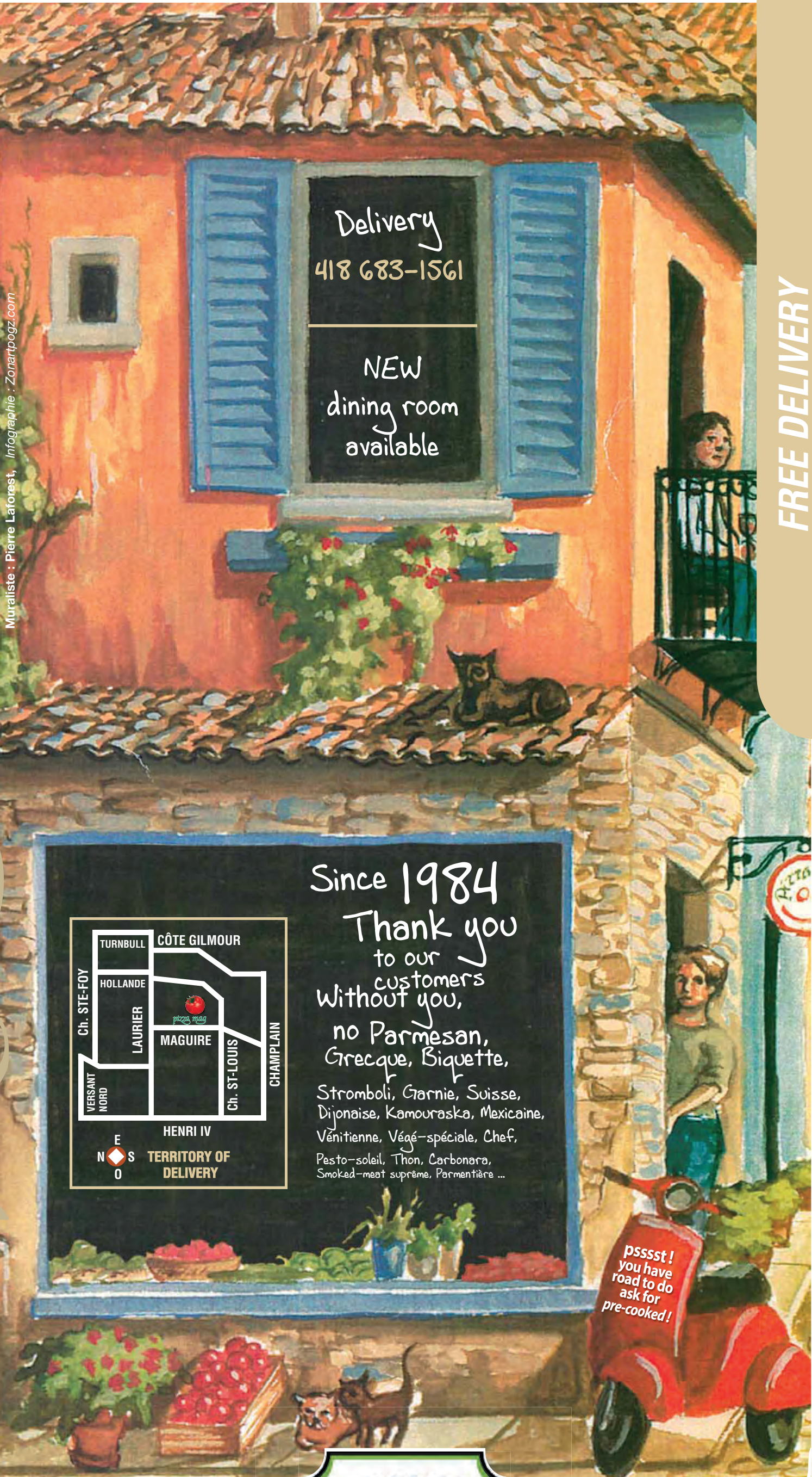
Muraliste : Pierre Laforest, Infographie : Zonartpogz.com